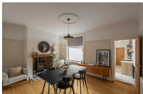
GROUND FLOOR 618 sq.ft. (57.4 sq.m.) approx.

IMPORTANT NOTE: These particulars and the descriptions and measurements herein do not constitute representation and whilst every effort has been made to ensure accuracy, this cannot be guaranteed.